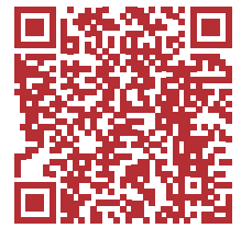
Mentor an Intern